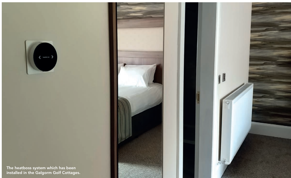
The heatboss system which has been installed in the Galgorm Golf Cottages.